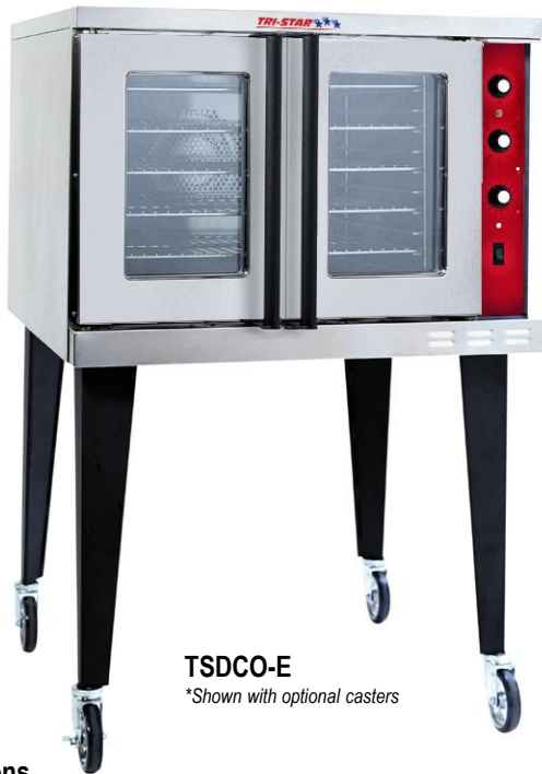
TSDCO-E *Shown with optional casters