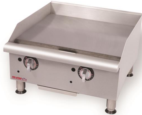
Model TSGGT-24i Gas Thermostatic Griddle