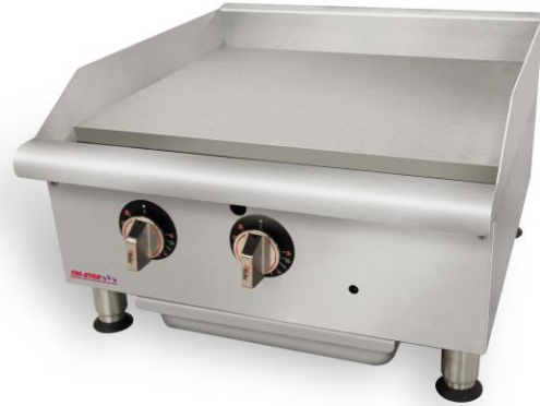
Model TSGGM-24i Gas Manual Griddle